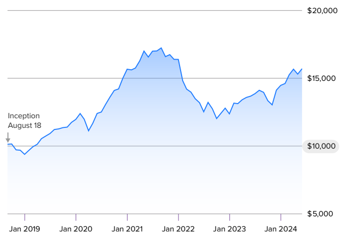
● Growth Fund

If you had invested $10,000 at inception, the graph below shows what it would be worth today, before fees and tax.